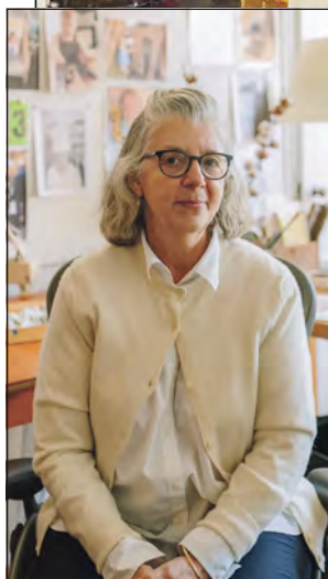
Maira Kalman

and invitation. "After seeing their work, you want to run home and throw out everything you have," she said. "You want to edit your life. You only want what is essential. The simplicity and beauty of Shaker design are rarely equaled... They have wit and wisdom. Clarity and kindness. They are practical and they sing. You just cannot go wrong."