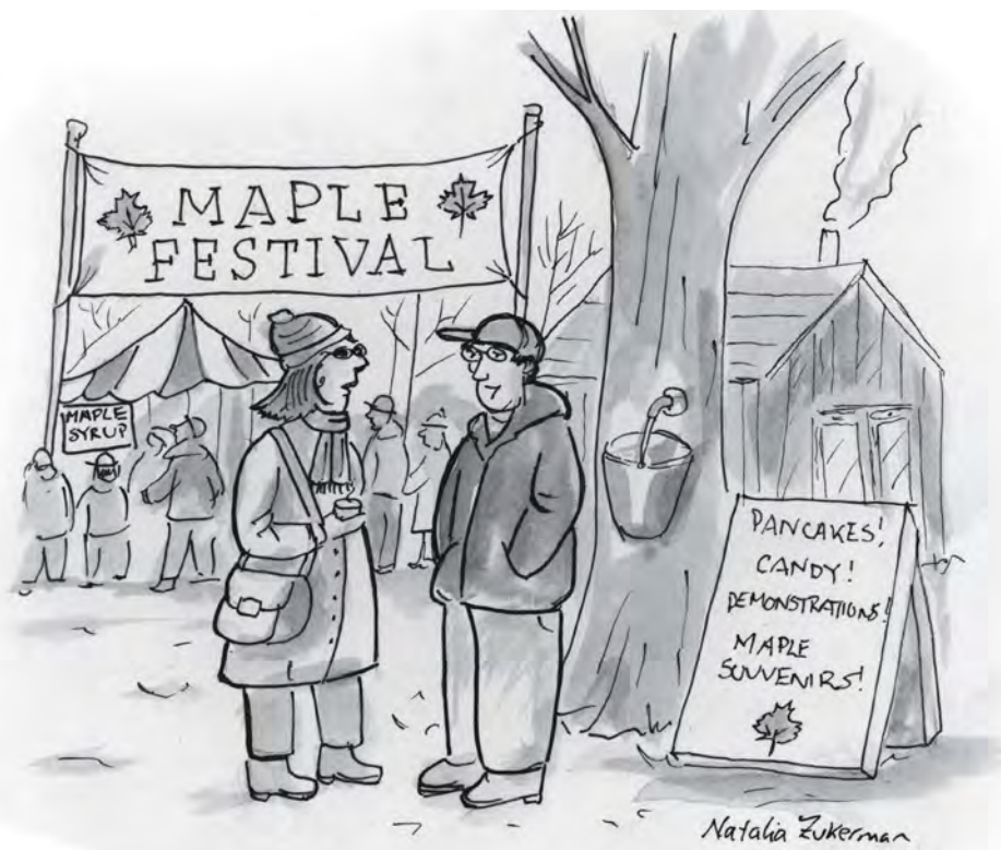
“I come for the tradition, I stay for the aggressively quaint marketing.”

The president’s solution? Build himself a ballroom. Call it a bunker if it helps.