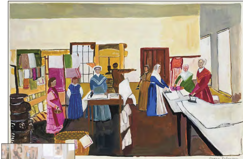
'The Laundry Room,' a painting by Maira Kalman from the exhibition "Shaker Outpost: Design, Commerce, and Culture" at the Shaker Museum's pop-up space in Chatham.

The idea of utility that is elevated to poetry is at the center of the show. Kalman described the impulse to "edit your life" after encountering Shaker design, and here that instinct becomes both curatorial method