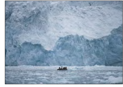
COMPASS 'Vulnerable Earth'; and more B1-4