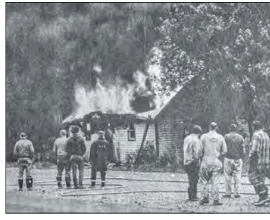
MILLERTON Fire Co. history A6