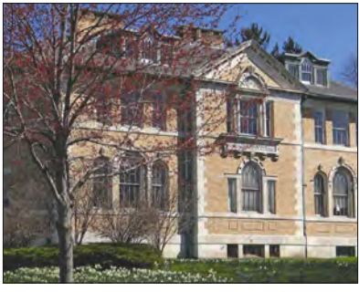
MILLBROOK Thorne Building A3