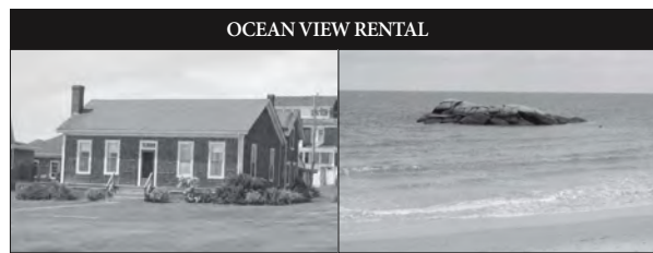
Wonderful Summer Beach house with 4 bedrooms. No pets, walk the beach, swim in the ocean, enjoy, sunsets, and surrounds. Massachusetts South coast location. AVAILABLE AUG 17-24. Call for additional information. Owner offered.

FOR NATURE LOVERS: AN ECONOMICAL LAND SITE WITH NATURE BOG; FOR BEACH LOVERS: AN AUGUST 12-24th RENTAL WITH OCEAN VIEW